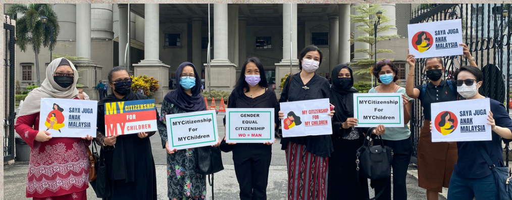
Impacted Malaysian mothers at the Kuala Lumpur High Court during one of FF's litigation hearings

In October 2024, Malaysia's Parliament passed the Constitution (Amendment) Bill 2024, granting Malaysian mothers the equal right to confer automatic citizenship on their overseas-born children, aligning with the rights previously held by Malaysian fathers. Family Frontiers, a Malaysian civil society organization, has been at the forefront of advocating for the rights of these children. In supporting Family Frontiers' efforts, Nationality For All (NFA) provided assistance to strengthen their operations and collaborated with them on the civil society joint submission for Malaysia's CEDAW and CRC reviews.