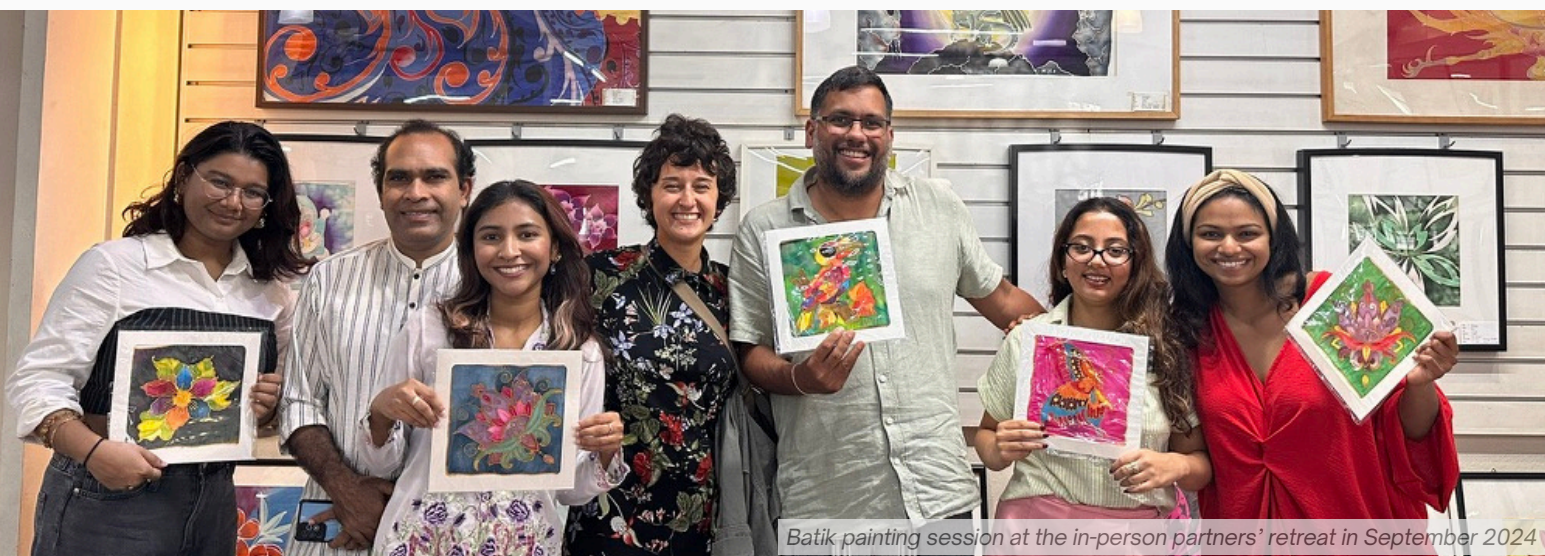
Batik painting session at the in-person partners' retreat in September 2024

A reflection that we have had through the partnership-building effort is that NFA's regional proximity to partners has proven to be a significant asset. Being based in the region has fostered closer collaboration, enabling NFA to cultivate deeper relationships and trust with partners. This has facilitated open communication and a nuanced understanding of partner needs, leading to more responsive and relevant support. This proximity has allowed NFA to identify emerging needs in real-time and provide timely, on-the-ground support.