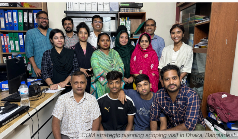
COM strategic planning scoping visit in Dhaka, Bangladesh

To provide strategic development support and get to know each of the organisations and their people better, we organised in-country visits to where they were based—Bangladesh, Malaysia and Nepal. These visits were aimed at facilitating a space for the organisations to reflect on how to be more strategic, what to be mindful of, and the necessary building blocks to create relevant and useful strategies. The in-country visits allowed us to better understand the specific contexts and challenges faced by each organisation, and support their strategic development effectively.