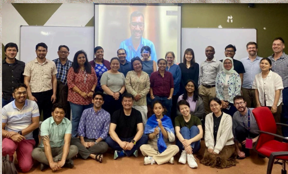
SDCC members at the launch of the coalition in Kuala Lumpur in February 2024

In 2025, the Steering Committee for the Statelessness and Dignified Citizenship Coalition - Asia Pacific (SDCC-AP) was formed, with representation from all five sub-regions and three impacted persons. SDCC-AP, officially launched in February 2024, has focused on strengthening its internal operations, including adopting a Constitution and safeguarding policy. The coalition also finalized its 2025-2027 Strategic Plan during a workshop in Nepal, outlining a collaborative approach to addressing statelessness.