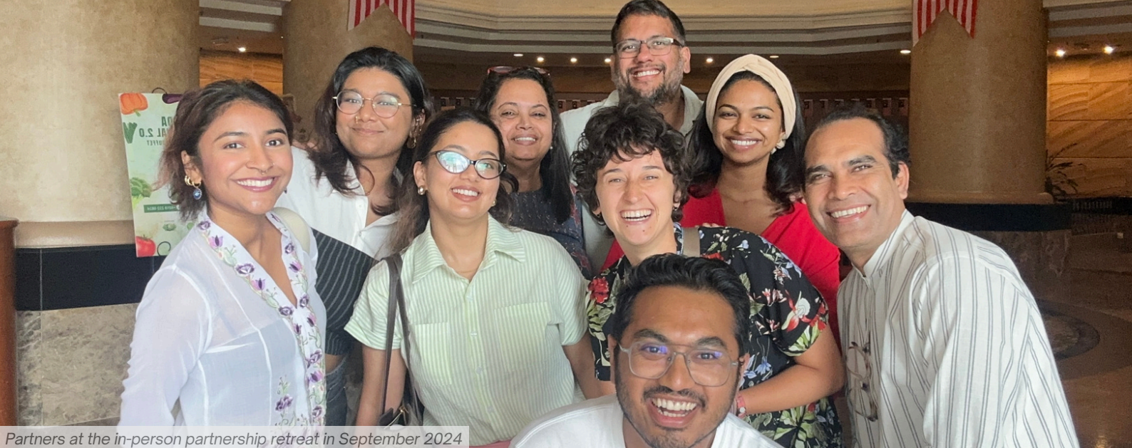
Partners at the in-person partnership retreat in September 2024