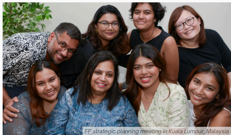
FF strategic planning meeting in Kuala Lumpur, Malaysia