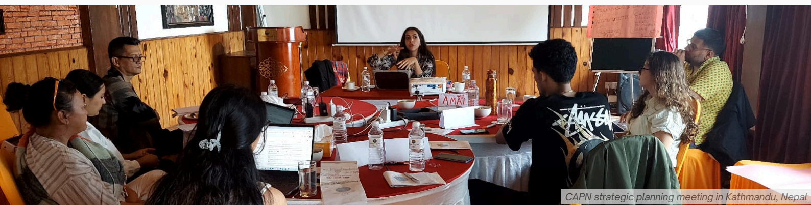
CAPN strategic planning meeting in Kathmandu, Nepal